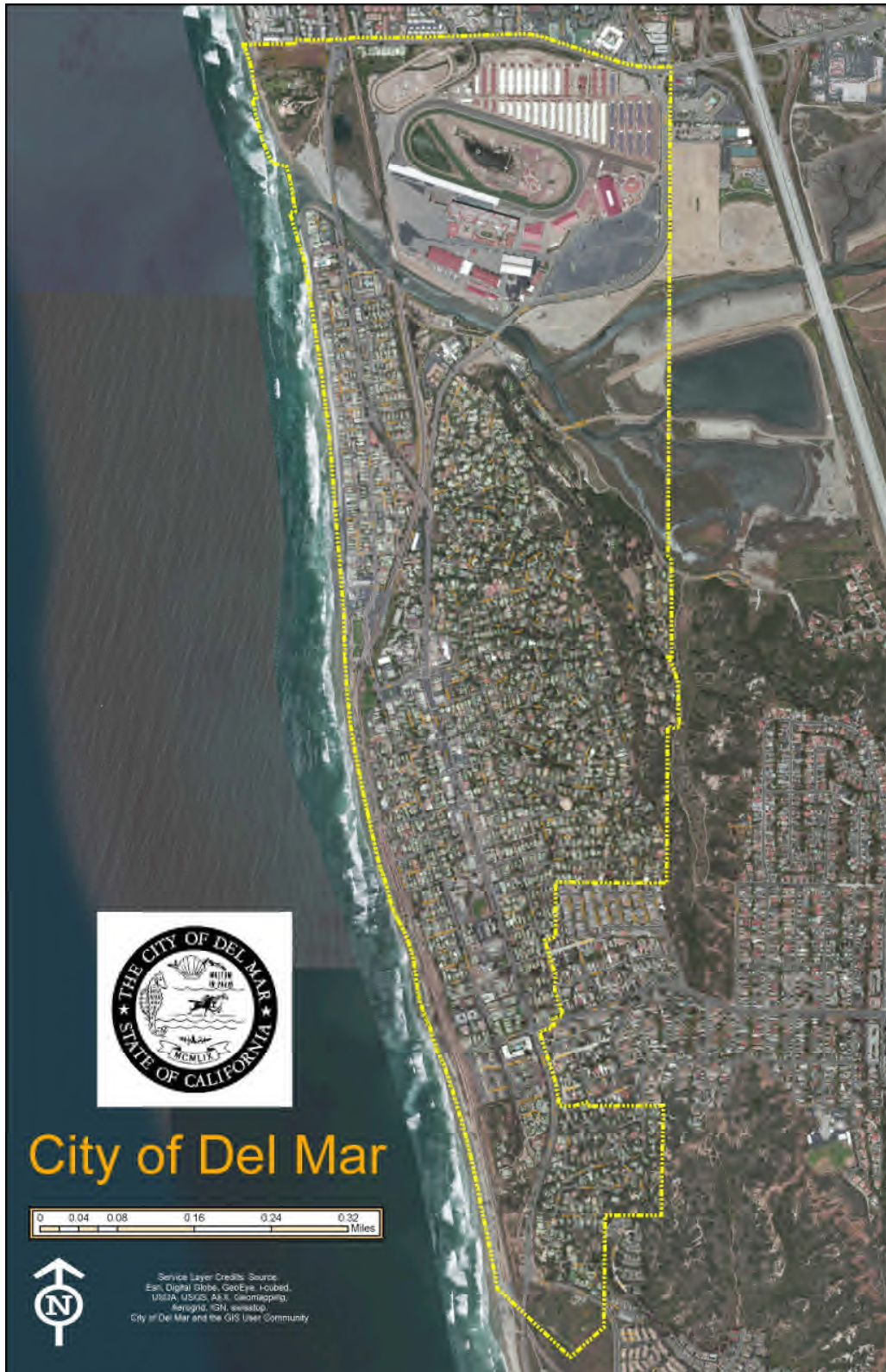
Figure 1.1 Del Mar Map